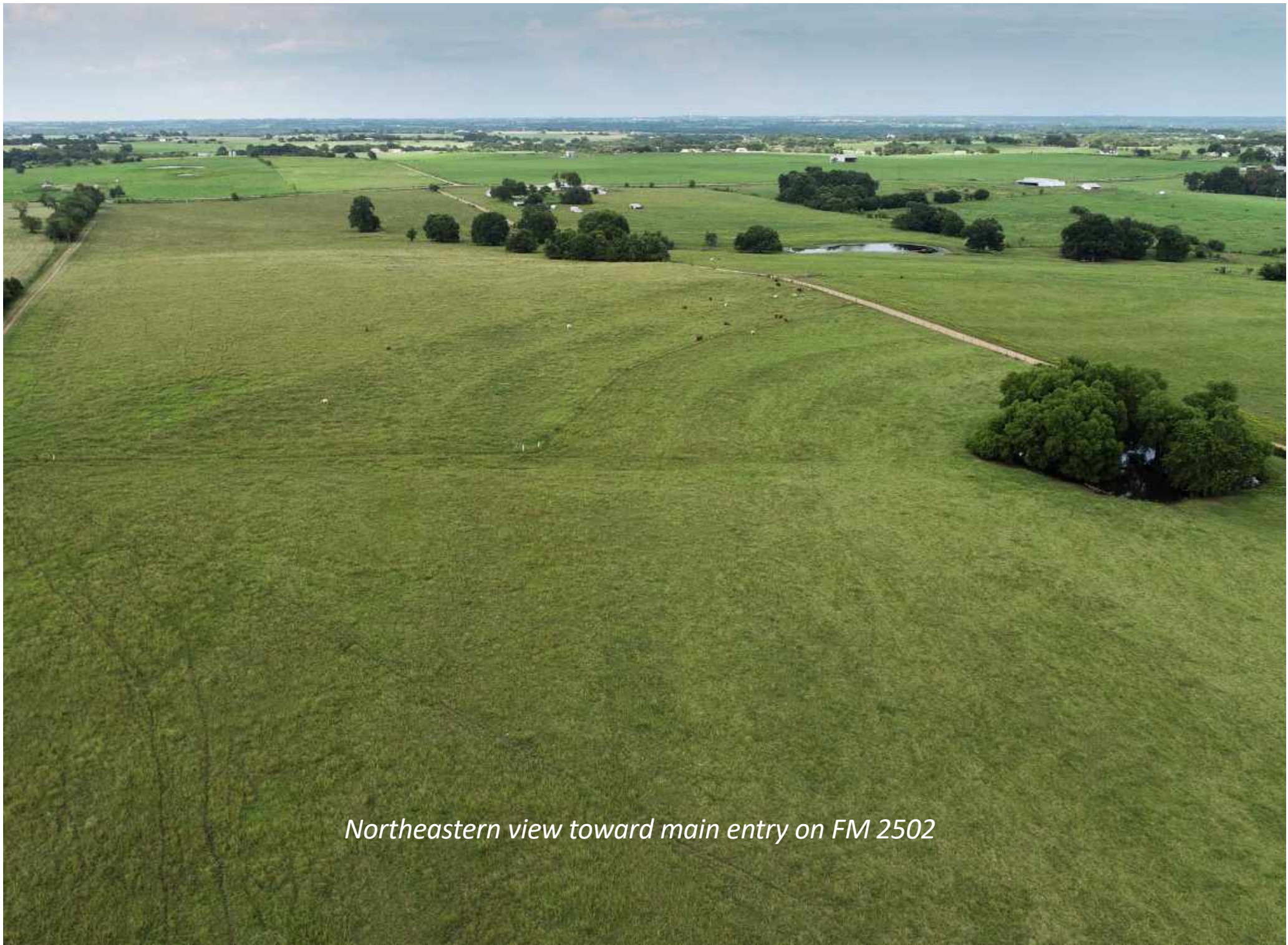
Northeastern view toward main entry on FM 2502